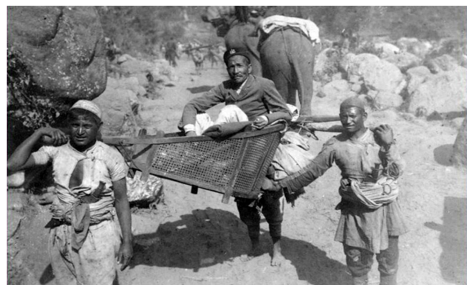
Early mode of Transportation