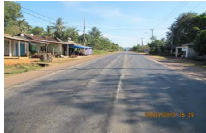
Some pictures of rutting in Vietnam