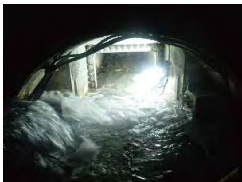
Heavy ingress water (Max. 24.6m 3 /min)