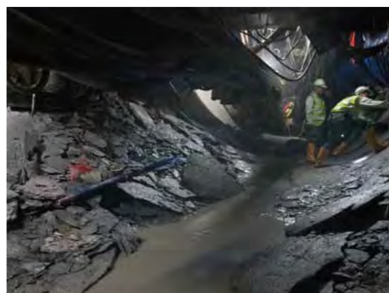
Rock burst at high overburden area (over 800m)