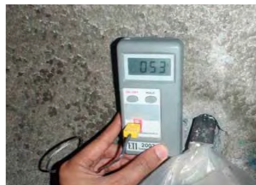
High rock temperature (Max. 55°C)