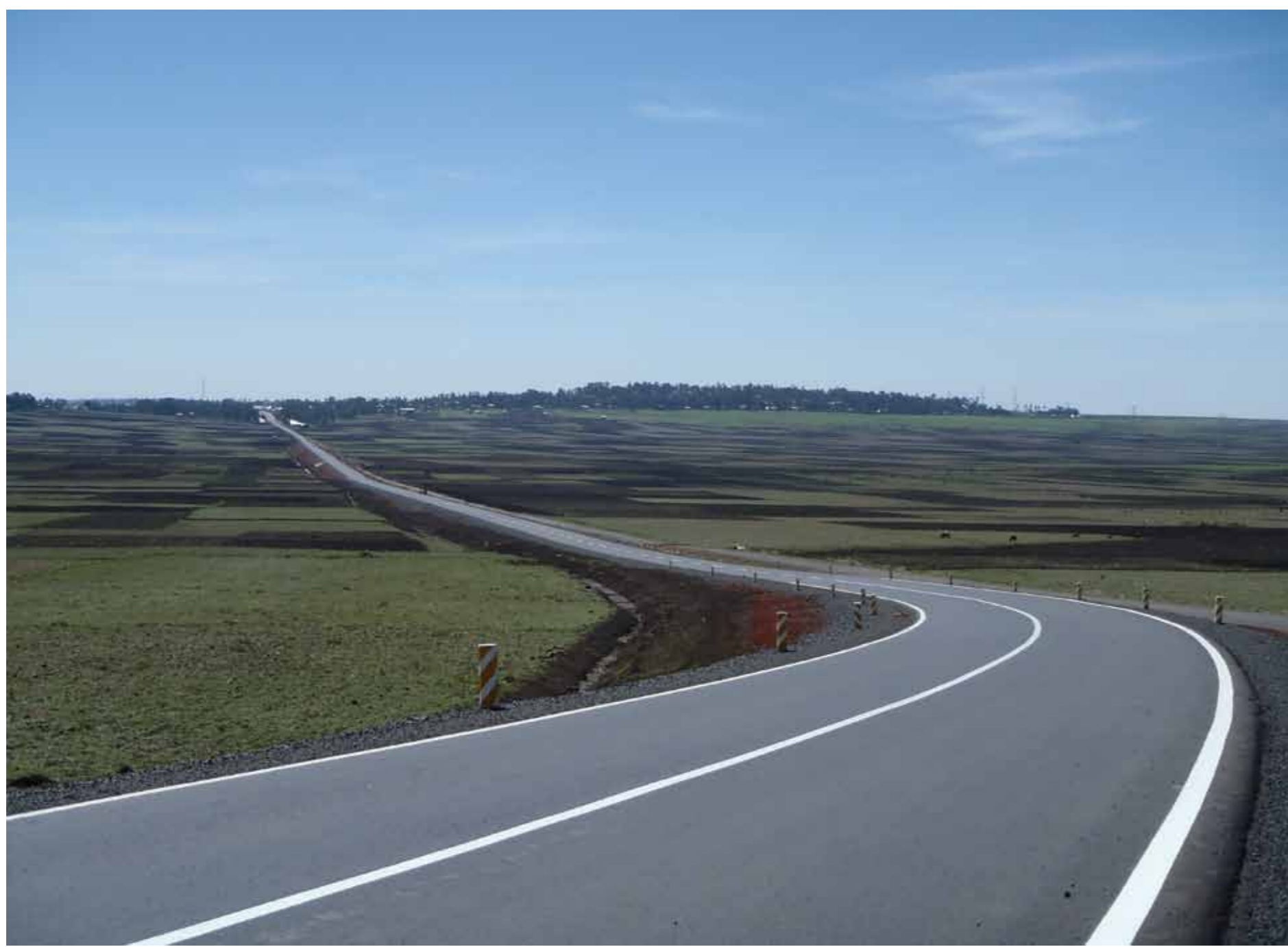
Completed section (Phase 4)